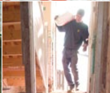
2. Carry the bags into the house (only 15kg)