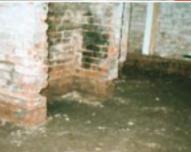
1. Dig out old floor