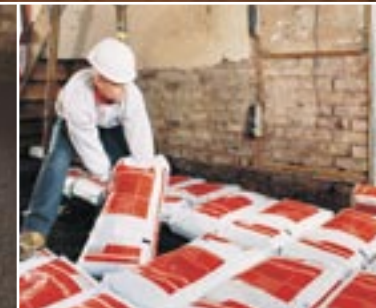
4. Lay the bags on the ground