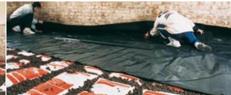
6. Lay a 1200 gauge damp proof membrane