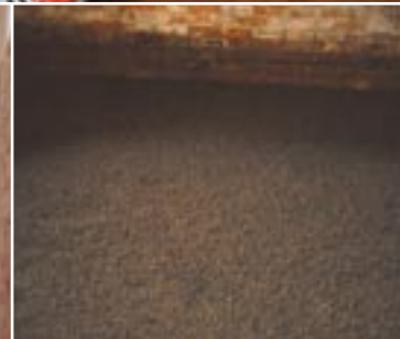
3. Use a small amount of material to level up the site