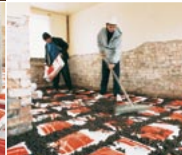
5. Use a little loose material to fill any voids and level the surface