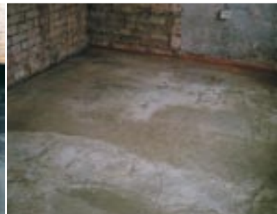
7. Pour the concrete or Weber levelling compound

Leca Insulation Fill saves around 40 man hours per house during installation of insulated solid floors. It cuts turnaround times, minimises disruption for residents and enables two labourers to prepare a 40m 2 base in just one hour, compared to two days for three labourers to do the same job using hardcore and polystyrene insulation.